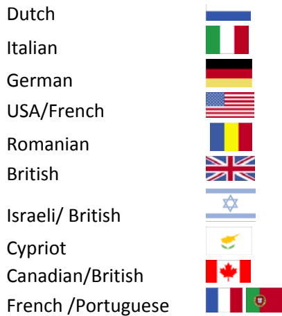
Figure 1: Where do LEAD Associates come from?